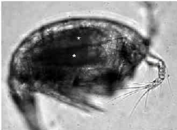
Fig. 1. Oncaea sp. female infected with two individuals of Blastodinium mangini v. oncaea (asterisks). Live specimen.

Blastodinium spp. could be detected in live copepods as large greenish or brownish bodies in the gut of infected animals (Figs 1-3). In fixed animals, infection with Blastodinium was less evident due to the lack of colour as a diagnostic tool. Based on the host species and the size and shape of the parasites (1), we were able to identify at least 3 Blastodinium species: B. mangini Chatton (including the variety B.