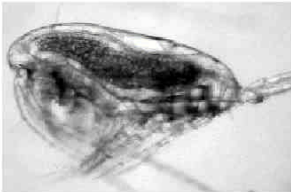
Fig. 2. Paracalanus parvus female infected with Blastodinium contortum . Live specimen.